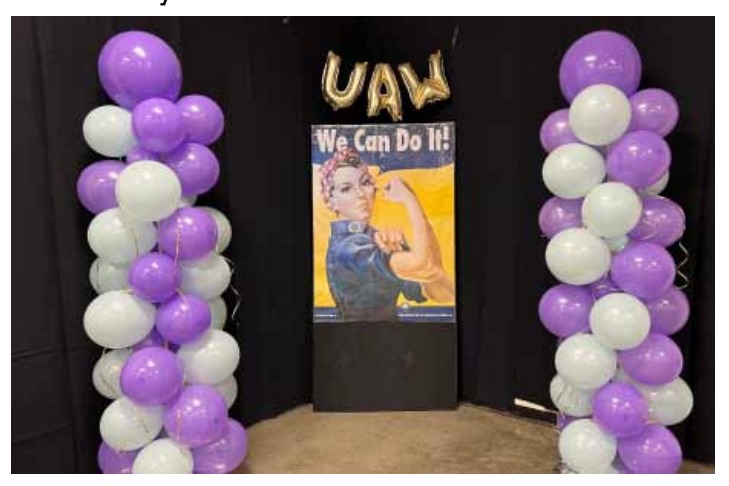
UAW Core Values

various charities. We do appreciate the support the committee gets from our membership and community.